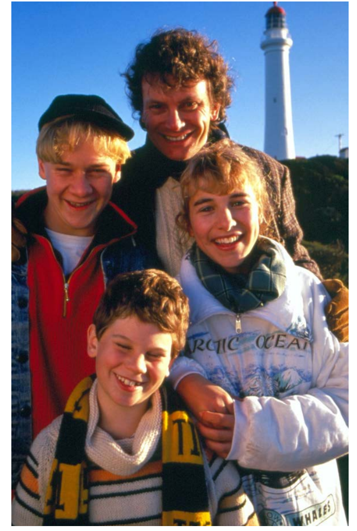
Multiple screenings around the world have seen many fans of Round the Twist grow up and visit the Split Point Lighthouse when they visit Australia

Round the Twist has also sold into the following territories: