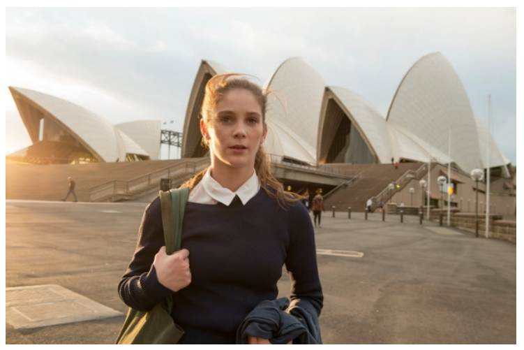
Children and teens all over the world became friends with the Dance Academy characters, sending the cast video tributes and following them on social media in huge numbers

Many ACTF series have found homes on the public broadcasters in various countries, such as Sveriges Television AB in Sweden who have repeatedly licensed Mortified since its launch. This is emblematic of a strong connection to the nation itself, as the public broadcasters, whose primary interest is public service, are often funded via their national governments. These broadcasters are also more likely to reach broad audiences in their respective territories.