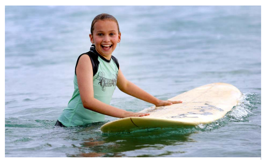
Mortified aired extensively in multiple territories via the Disney Channel

Antigua, Argentina, Aruba, Austria, Bahamas, Bangladesh, Barbados, Belgium, Belize, Benin, Bolivia, Brazil, Brunei, Bulgaria, Burkina Faso, Cambodia, Cameroon, Canada, Central Africa Republic, Chad, Chile, China, Colombia, Congo, Costa Rica,